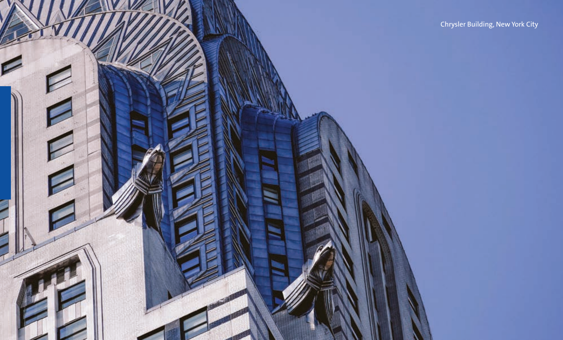
Chrysler Building, New York City