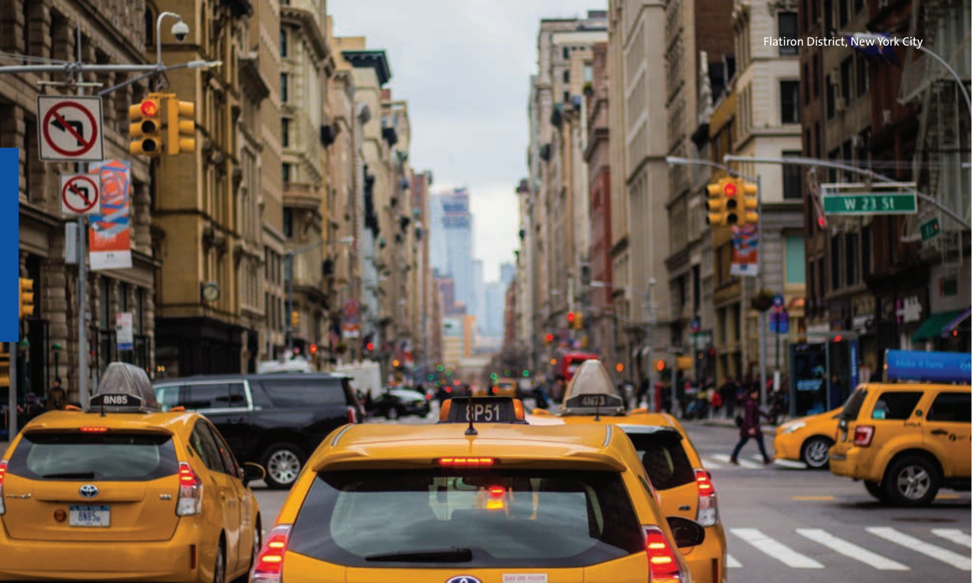
Flatiron District, New York City