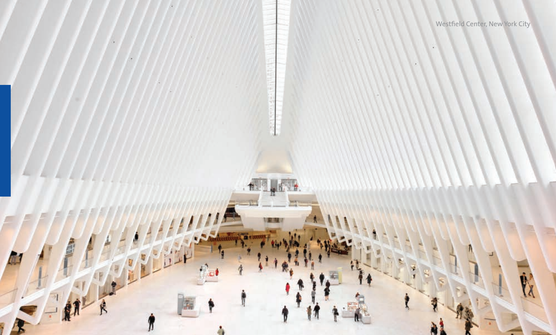
Westfield Center, New York City